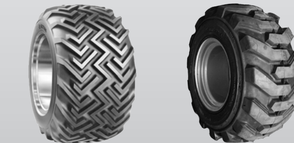
31x15.5-15 TR-06 (76x37 cm) 128 cm machine width