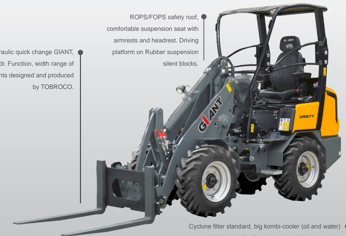
Cyclone filter standard, big kombi-cooler (oil and water) 2 big hydraulic oil tanks, modern Kubota engine.

ROPS/FOPS safety roof, comfortable suspension seat with armrests and headrest. Driving platform on Rubber suspension silent blocks.